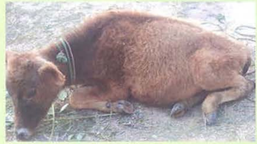
Fig 1. Calf presented with history of weakness & unable to get up.

A 5 months old female calf was presented to the Dept. of T.V.C.C. with complaints of inappetence, weakness and unable to get up for last 4 days. Clinical examination of animal revealed almost normal rectal temperature (100.80F), rough hair coat, ticks over the body, pulsation of jugular vein and papery white conjunctival mucous membrane. Haematology showed decreased haemoglobin (2.2 gm/dl) and packed cell volume (7.0%) level. Blood smear stained with Giemsa stain were negative for haemo-protozoan parasites and faecal examination revealed the severe infestation of strongylosis. Considering the severity of anaemia 350 ml blood was collected from the dam of calf in CPDA (Citrate Phosphate Dextrose Alanine) bag and was transfused through jugular vein of calf @ 15 ml/kg body weight after major and minor compatibility test. Immediately after completion of transfusion calf get up and started walking. Further, calf was administered, Inj. Belamyl @ 2ml Im, and Inj. neuroxin -12 @ 2ml Im for 3 consecutive days and Inj. feritas @ 1ml Im at 3 days of intervals for 4 times. After day 3 of treatment calf was given Albomar @ 7.5 mg/kg body weight orally and advised to repeat the same on day 21.