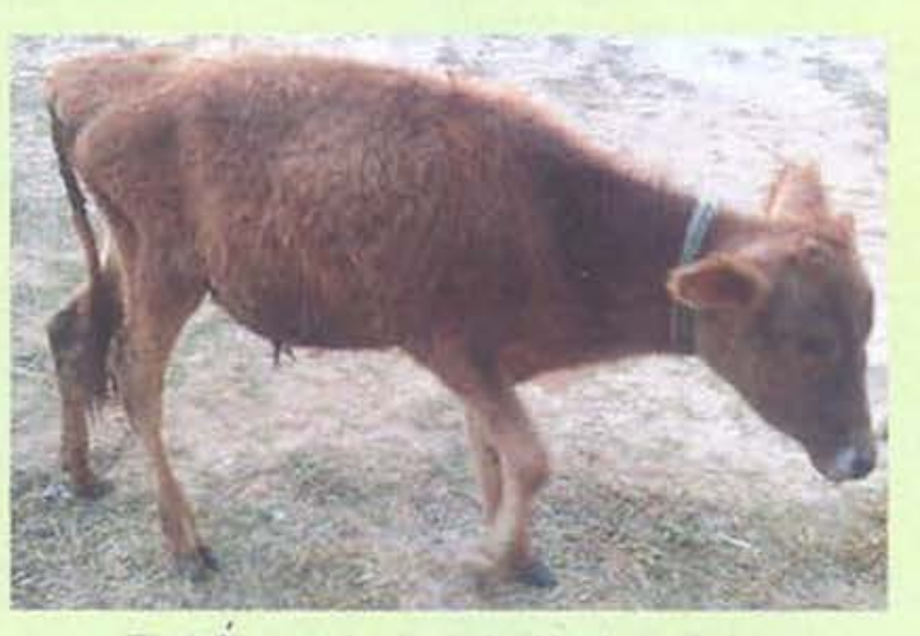
Fig 4. Recovered animal after blood transfusion.