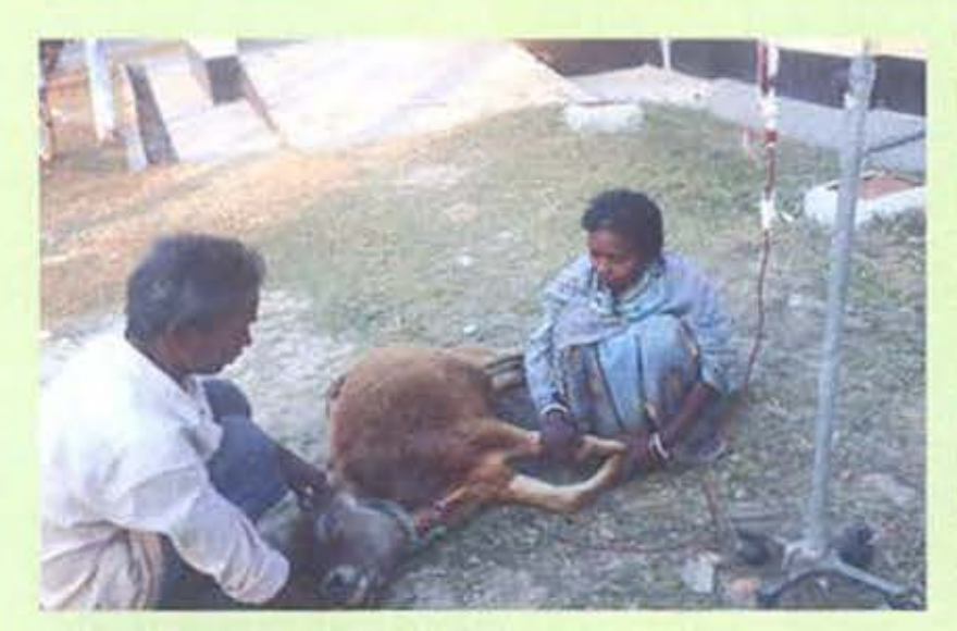
Fig 3. Blood transfusion in severely anaemic calf.