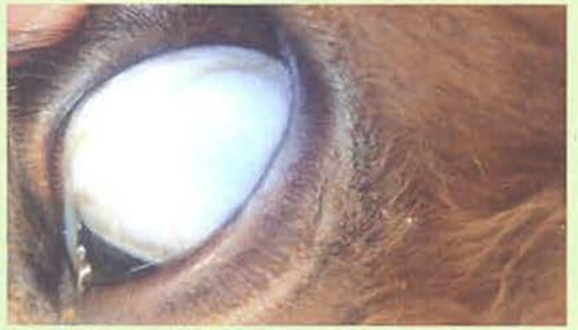
Fig 2. Papery white conjunctival mucous membrane.