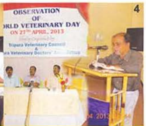
Glimpses of different programme organised on the occasion of World Veterinary Day - 2013