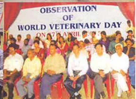
A Rally and Cultural Programme conducted by the Veterinarians, Faculty members & students of the College of Veterinary Sciences, R. K. Nagar, Agartala